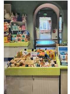
Modern Museum Shop