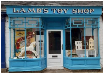
Victorian Toy Shop

Can you work out which shop the toys in the pictures belong to? Stick them in the right shop.