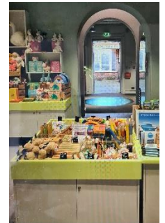
Modern Museum Shop