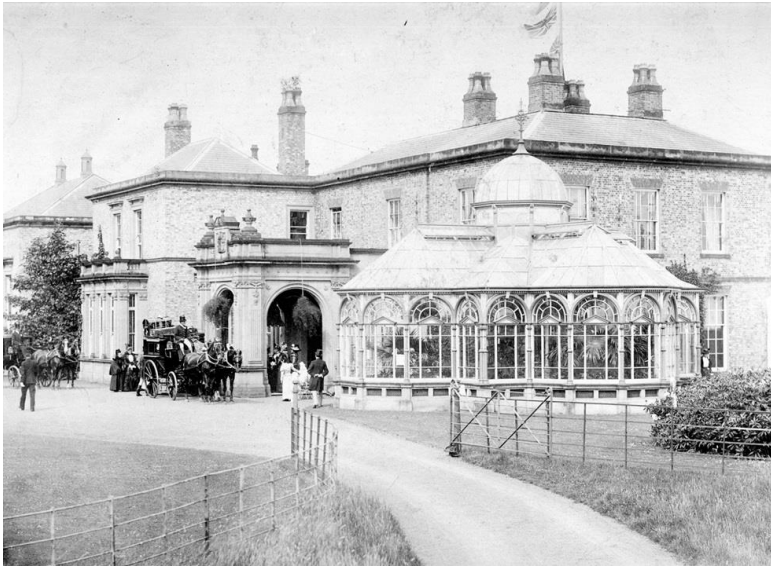
Preston Hall in the 1880s