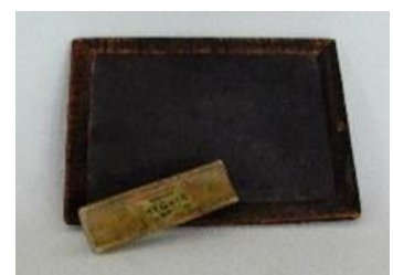
Slate and pencils