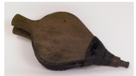
Bellows to help light fires