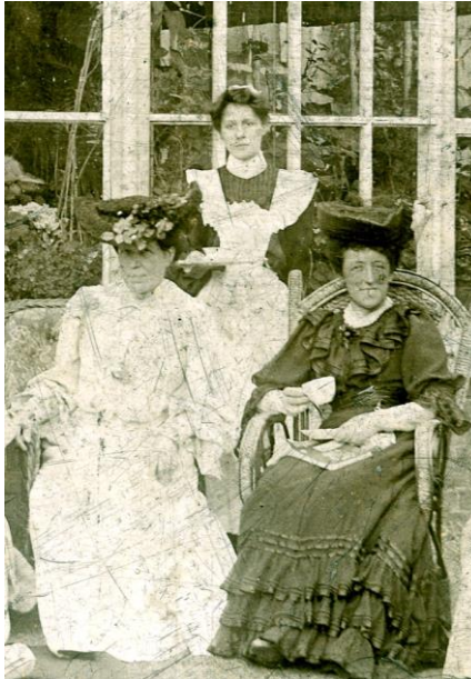
Maid serving afternoon tea

Today, it is hard to imagine what life in service was like or what it would be like to have servants.