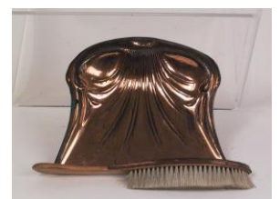
Crumb brush and pan