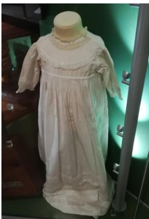
Victorian christening gown